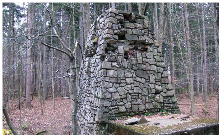
Old stone furnace located on the Newton Road side of the park. Not much is known about the history of this structure.

The Conservancy is grateful to everyone involved for the generous donation of $5,233 made to the CRC’s general fund from the sale of the works displayed at the exhibit.