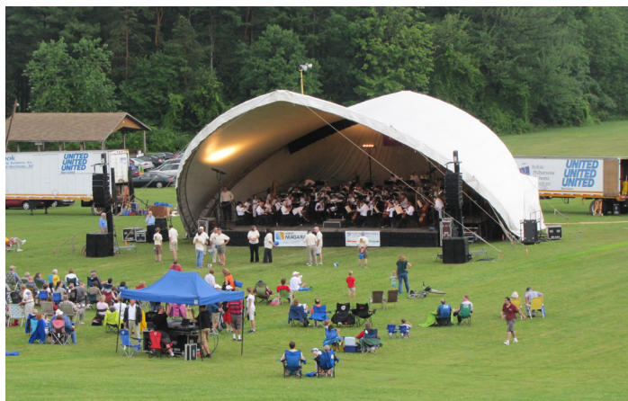
The Buffalo Philharmonic Orchestra last performed at the Ridge in 2011.

The Conservancy has been in negotiations with the BPO for months, hoping to capture the same excitement and enthusiasm generated at the last concert in the park back in July of 2011. Admission is free. All are welcome.