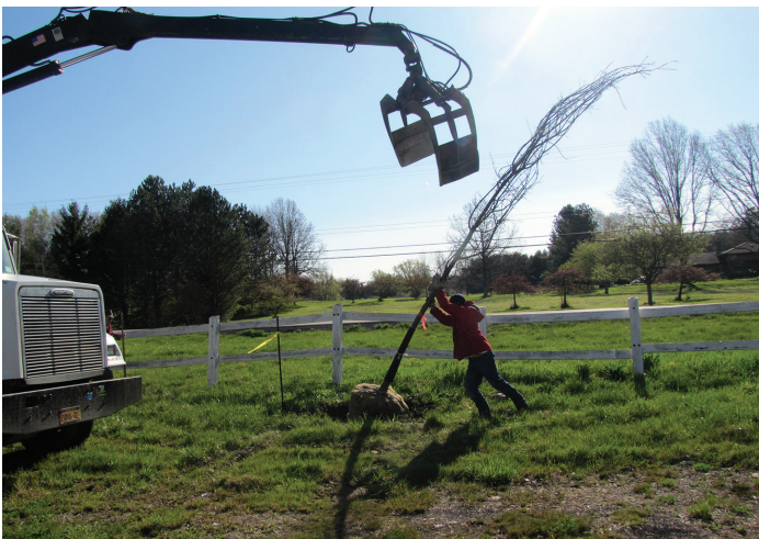
One of ten oak trees being deposited in a hole in the Eternal Flame parking lot.

The trees were needed to replace a number of maple trees that had been planted several years ago but failed to thrive. George Schichtel, owner of Schichtel's Nursery in Springville, NY and good friend of the Conservancy, donated the juvenile trees, his flatbed truck, and a team of workers to deliver and unload them.