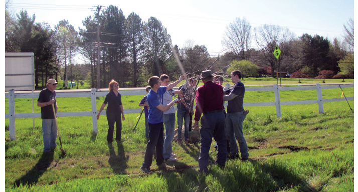
Our dedicated team of volunteers untangle branches of one of the juvenile oak trees.

Once the trees were on the ground, volunteers removed the burlap bags, untangled the branches, and covered the roots with top soil and mulch.