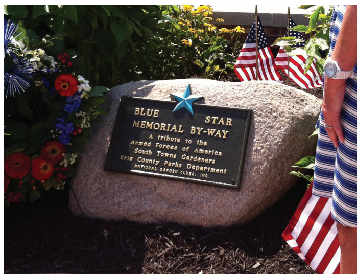
The Blue Star Memorial By-Way marker resides in the Chestnut Ridge Honor Garden

More information on the program can be found at GardenClub.org