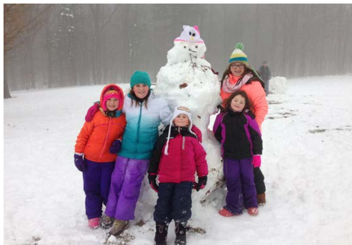
Do you want to build a snowman?