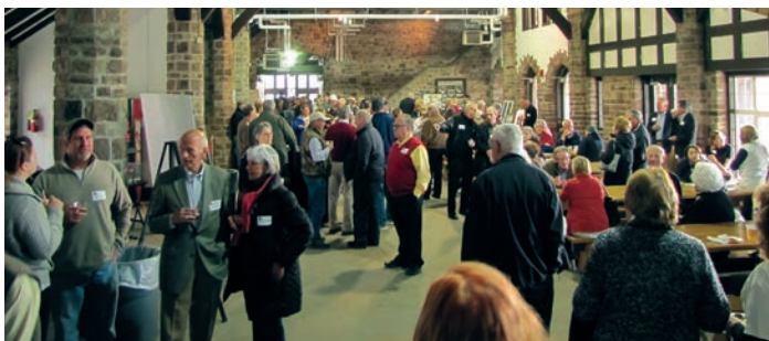
A full house for the April 21, 2015 Mural Restoration Celebration.