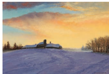
Two Above (2015) by Charles Houseman

The Exhibition runs May 30 - July 18, 2015