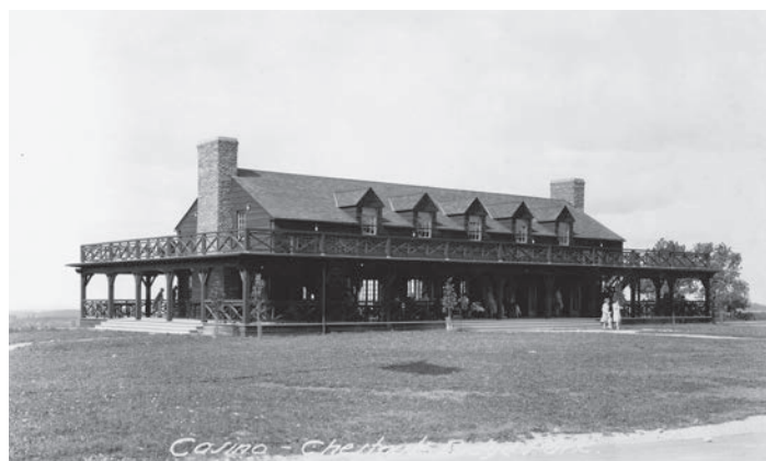
The original Chestnut Ridge Park Casino — c. 1927