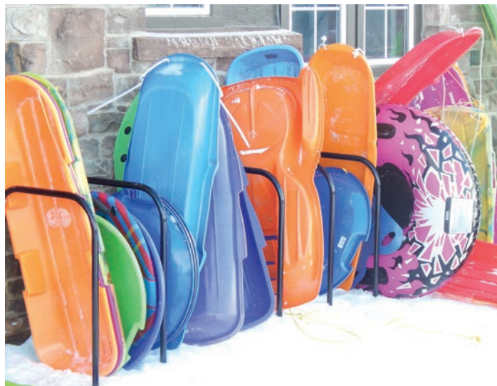
Sleds safely stored in the Conservancy's multi-purpose bikesled racks during Winterfest on January 25, 2015.