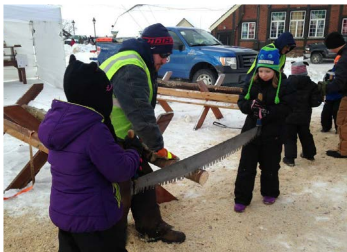
Winterfest guests try their hands with a two-person cross-cut saw