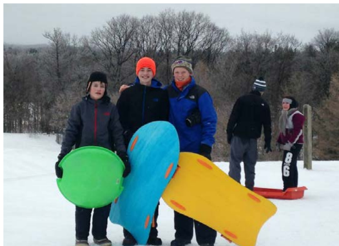
2015 was a great year for sledding