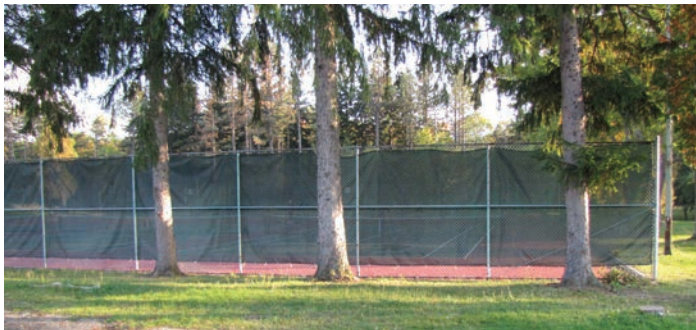
The CRC contributed the new windscreen for the tennis courts

Since 2012, the Erie County Department of Parks, Recreation and Forestry has spent $1,282,888 on capital improvements in Chestnut Ridge Park including entrance lighting as well as improvements to shelters, roadways, guard rails, and parking lots. More than $198,150 on the tennis courts alone to resurface, paint, and add new nets and hardware.