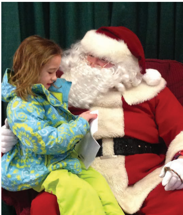
Santa makes a new friend at this year's Santaland