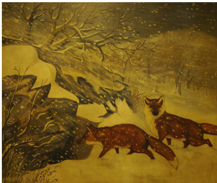
Foxes mural