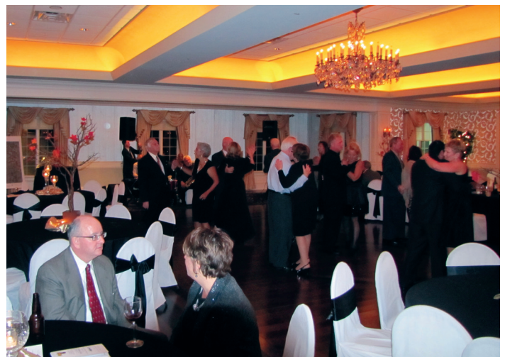
Dancing the Evening Away ...