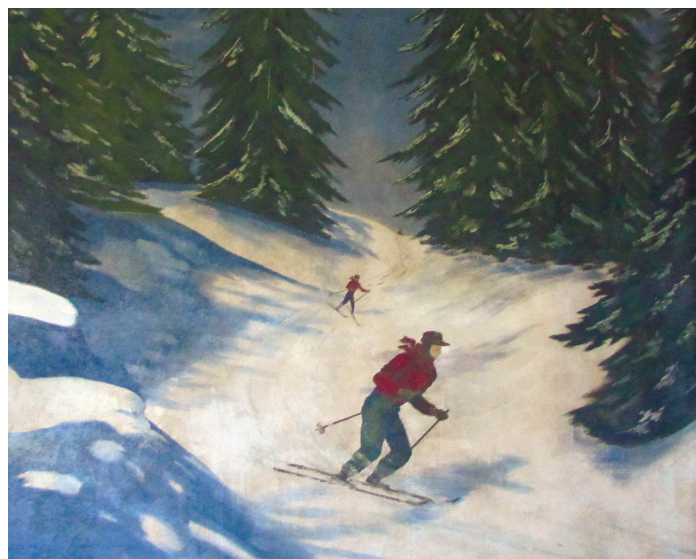
Skiers mural

The CRC will be shortly embarking on the restoration and conservation of the five murals located in the Chestnut Ridge Casino. These magnificent wall paintings were completed in 1948 by an artist known only as " Feldman ." His (or her) full identity is a mystery, as our extensive search for clues about the artist's resume and history have come up empty.